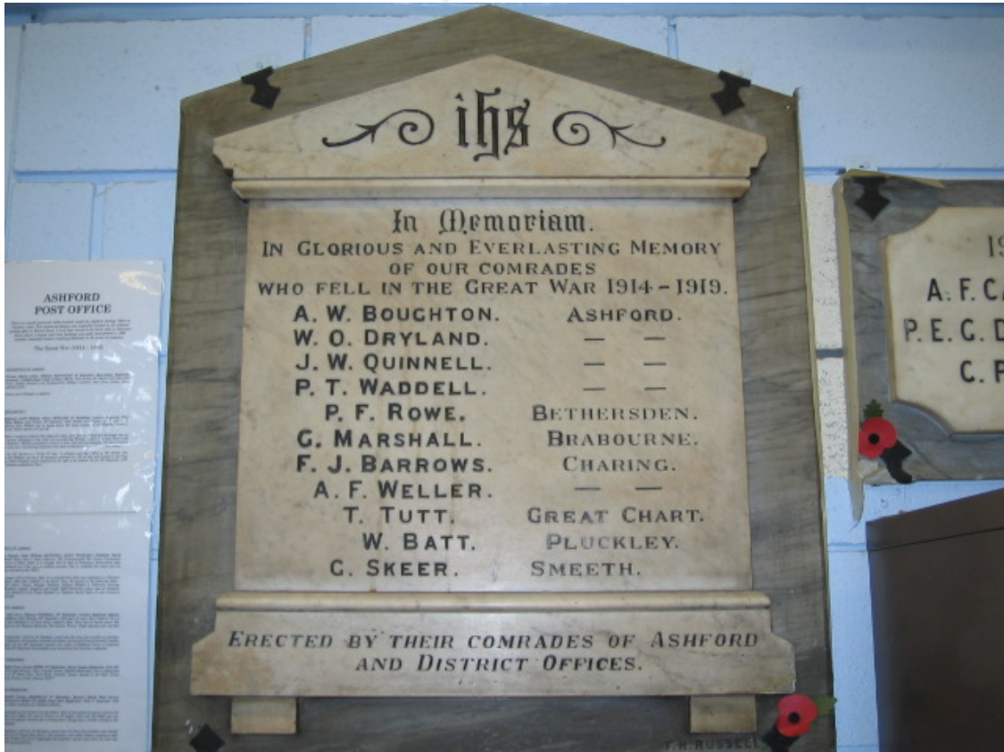
Ashford Sorting Office

This memorial plaque was originally located at the Ashford General Post Office in central Ashford. It now hangs on the wall inside the new Royal Mail Sorting Office in Tannery Lane, Ashford. Surely this monument belongs in the Ashford General Post Office in central Ashford where the local residents can actually see it?