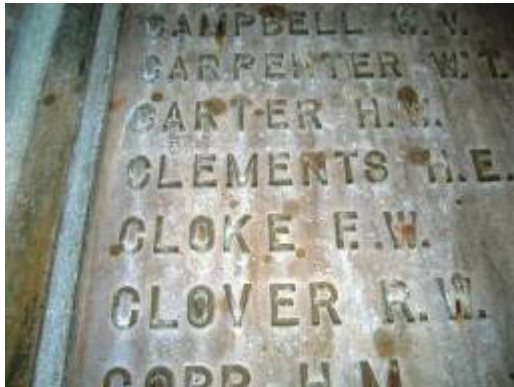
Ashford War Memorial

Not recorded as a war casualty by the CWGC