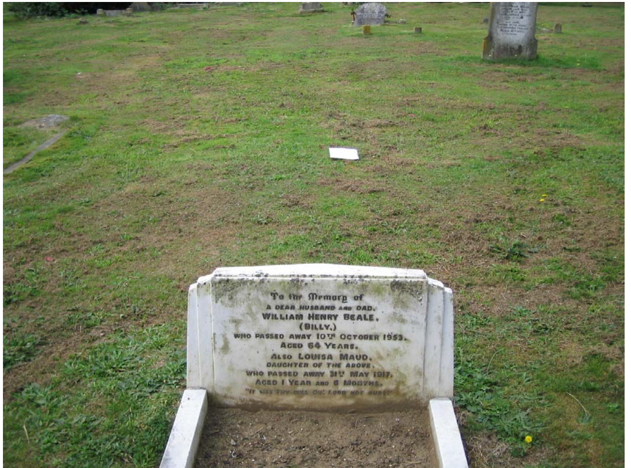
Frederick's Grave in the old Ashford Cemetery (unmarked behind W Beale)