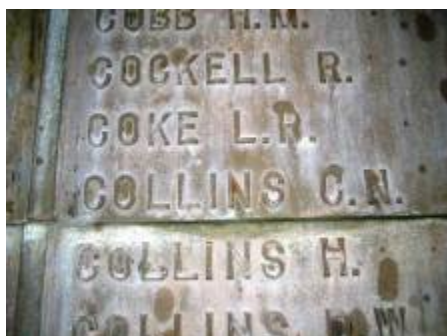
Ashford War Memorial