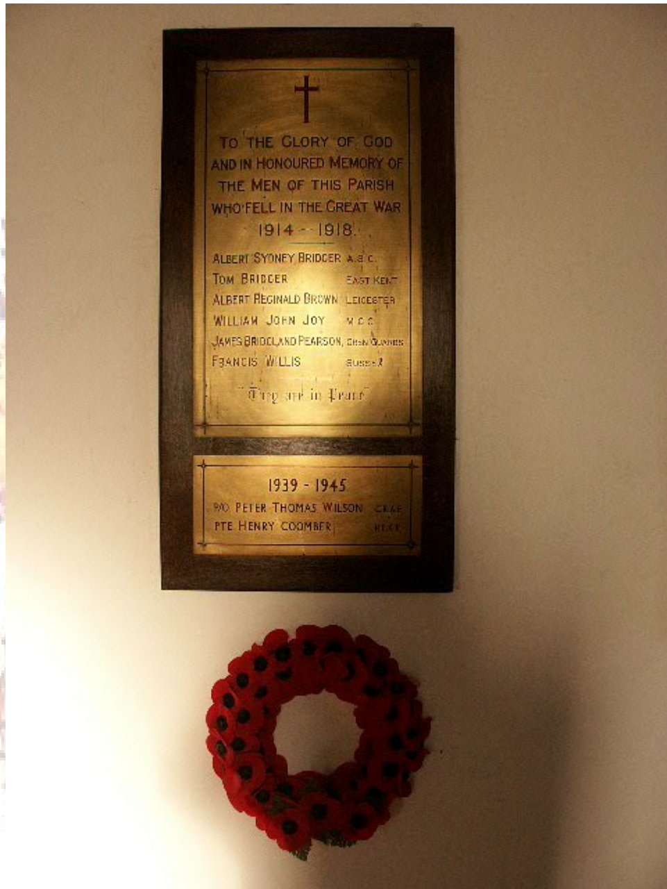
The Great War 1914-1919