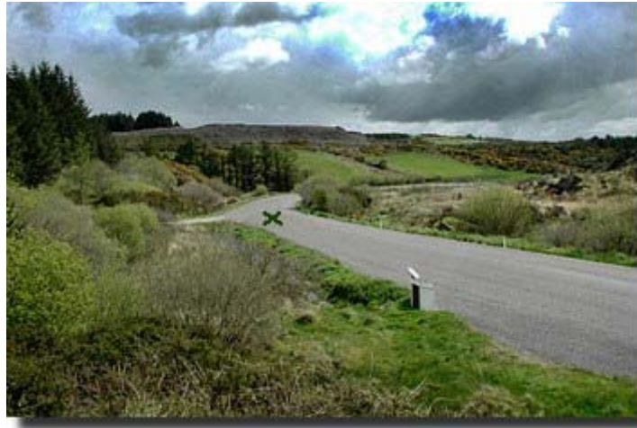
X MARKS THE SPOT WHERE THE FIRST TRUCK STOPPED