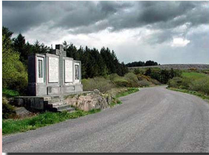
THE AMBUSH SITE TODAY