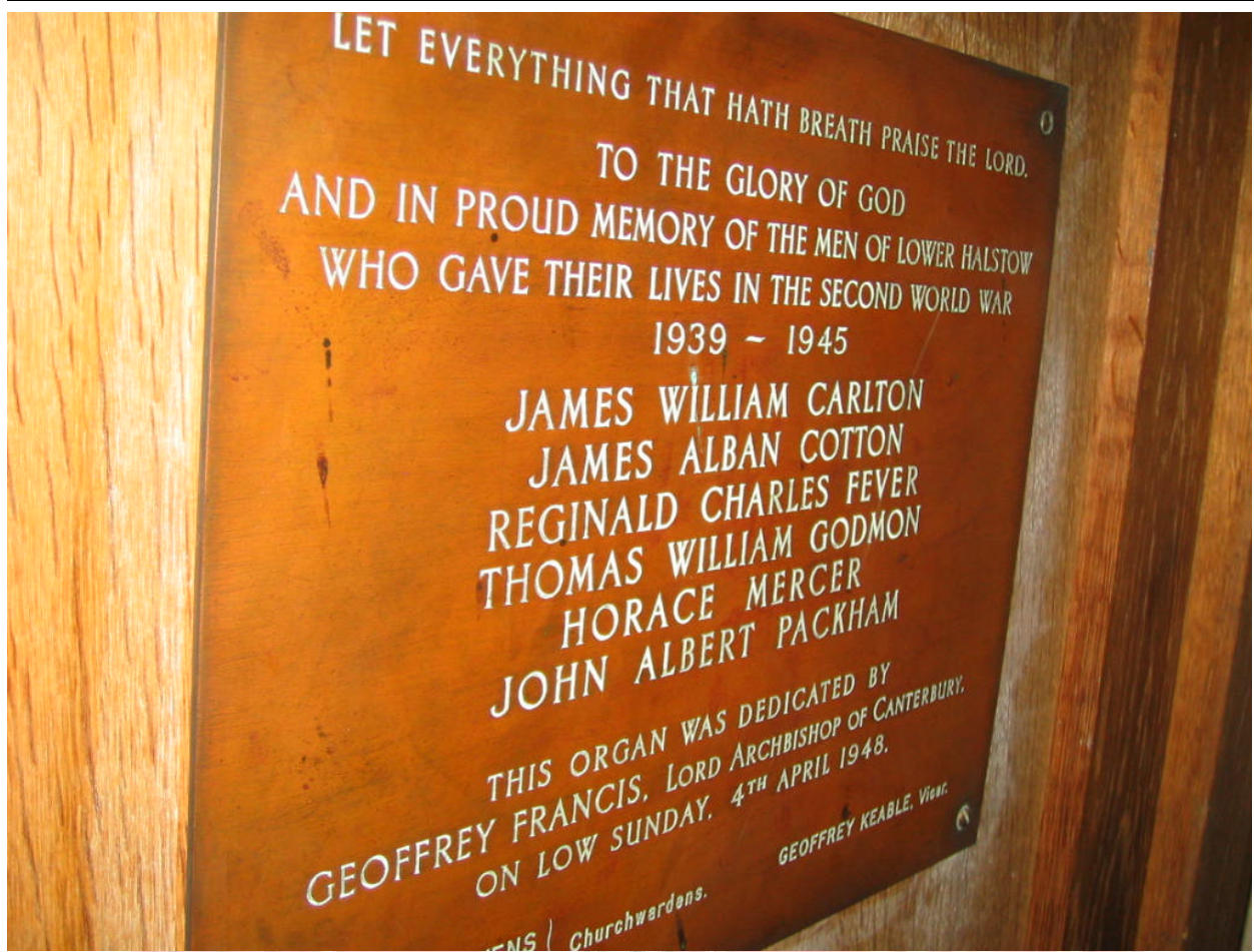
Someone has placed the WW2 tribute in a very stupid and awkward position!