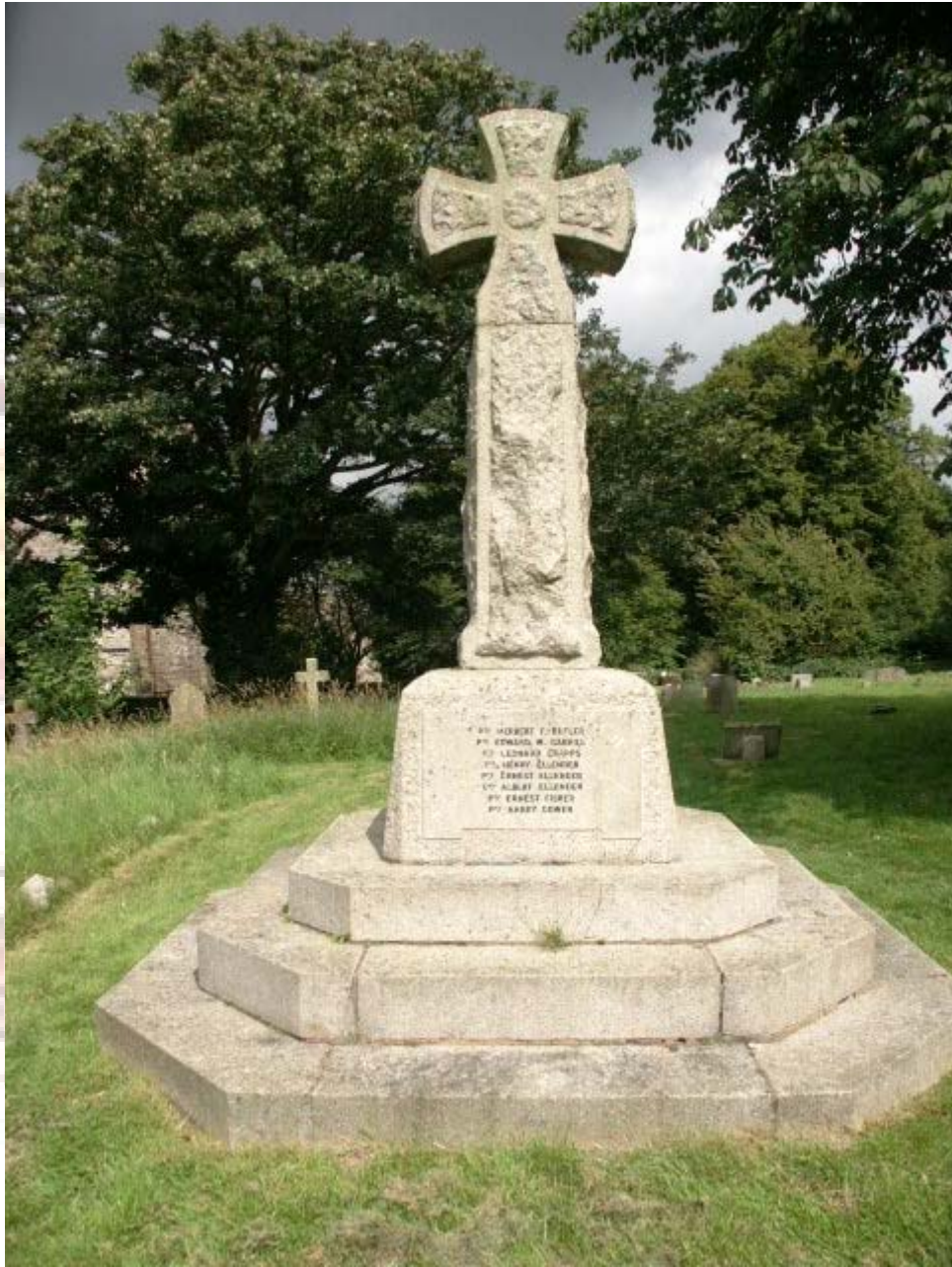
The Great War 1914 -1919