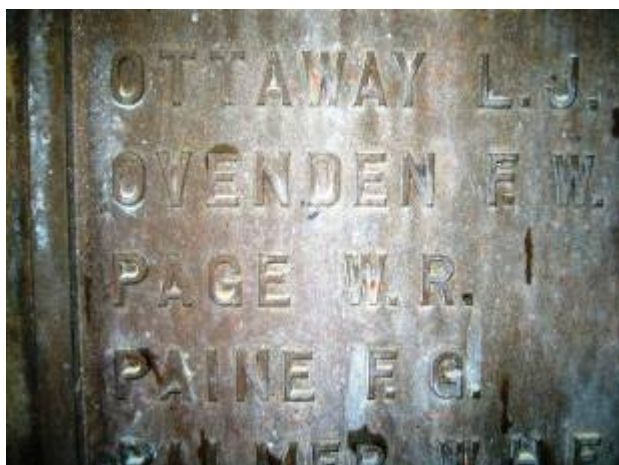
Ashford War Memorial

Not recorded as a war casualty by the CWGC