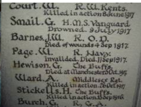
Railway Rolls 1